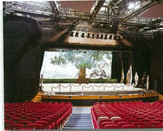
The Ko Shan Theatre in Hong Kong is mainly used to support Cantonese opera performances

each, a centre array of eight M1D line array modules and two 700-HP subwoofers concealed in the ceiling rigging. Six MM-4XP self-powered loudspeakers provide front-fill and three UPA-1P loudspeakers cover