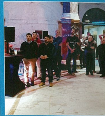
Guests at the Ecler anniversary party